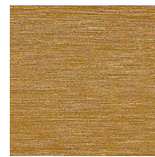
NATURAL TEKWOOD N