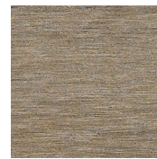
VINTAGE TEKWOOD V